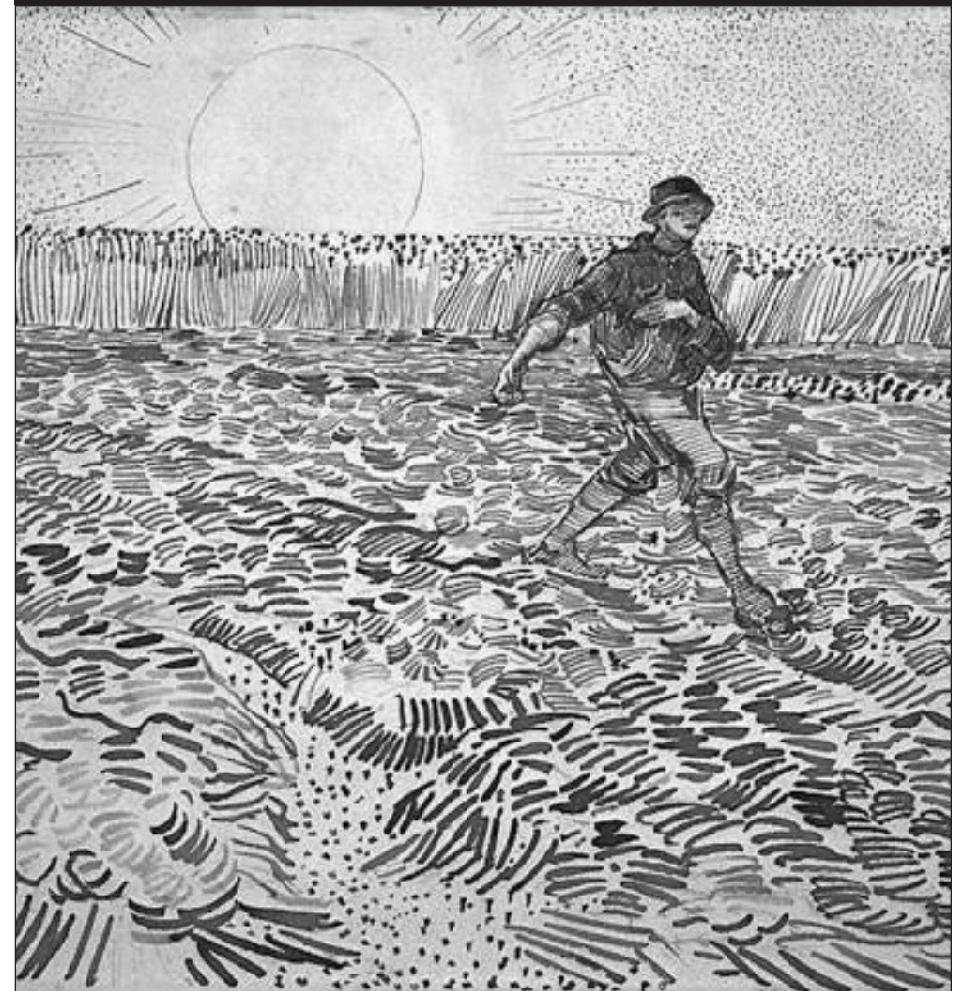
Pencil sketch of Vincent Van Gogh Sower with Setting Sun

Fifth Sunday after the Epiphany • February 4, 2018